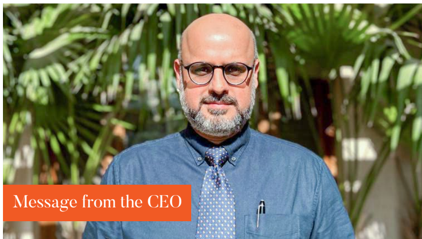
Message from the CEO

“Without education it is complete darkness and with education it is light. Education is a matter of life and death to our nation.”